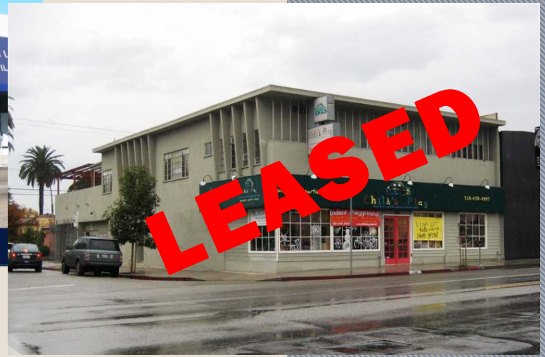
2299 WESTWOOD BOULEVARD