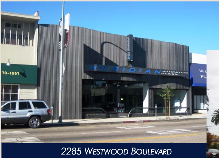
2285 WESTWOOD BOULEVARD